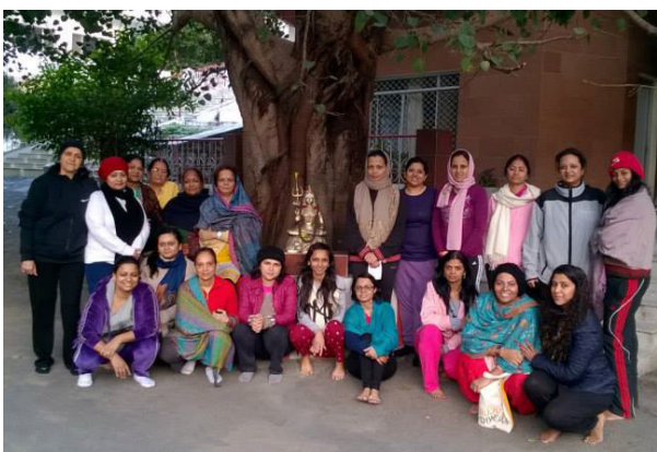
Visited the Omkananada ashram