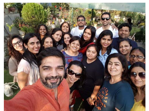
Followed by a group selfie