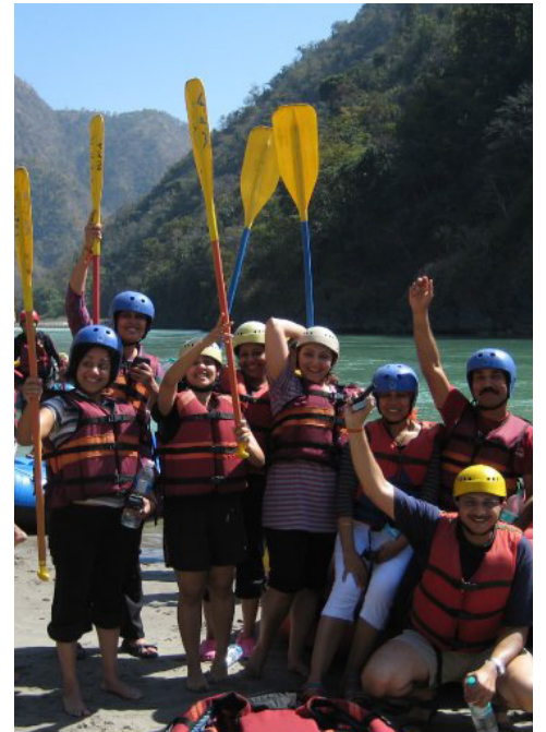
All set for rafting